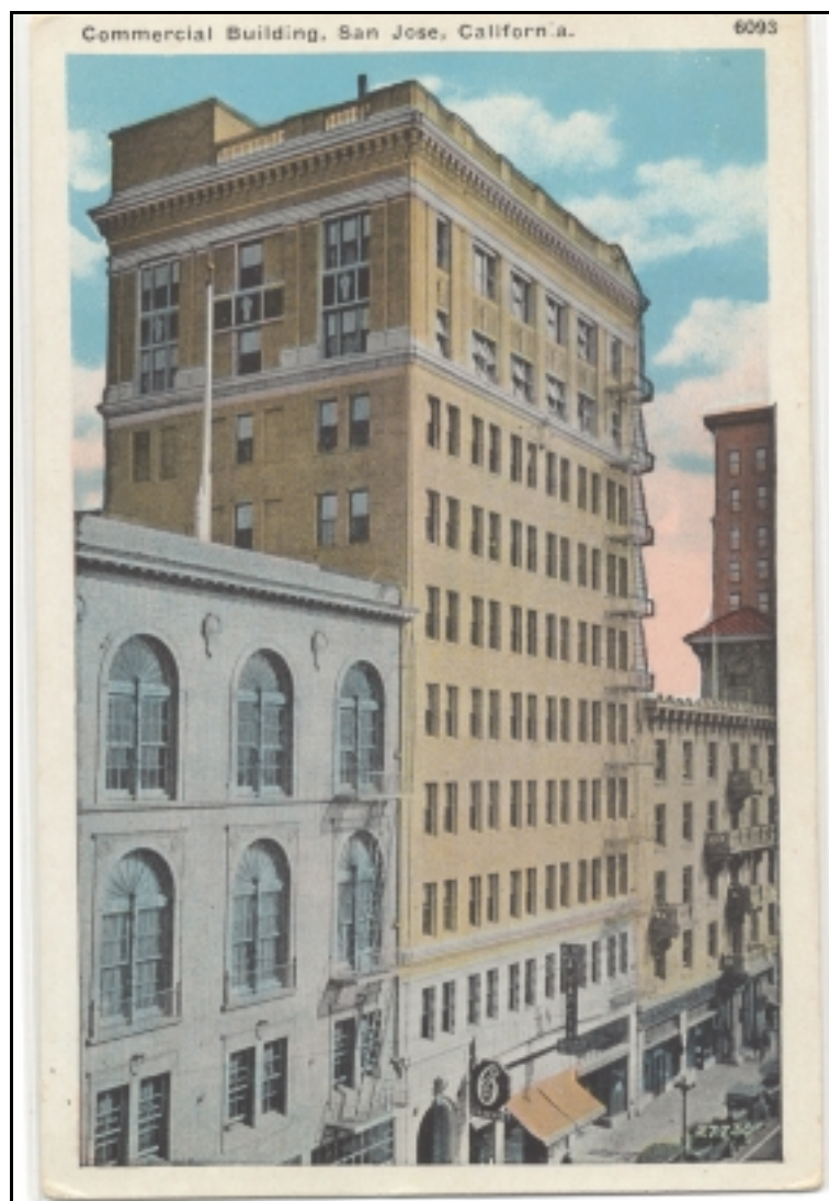
Above: San Jose Hospital, since torn down. Left: the Commercial Bldg., a San Jose landmark at 28 N. First St.