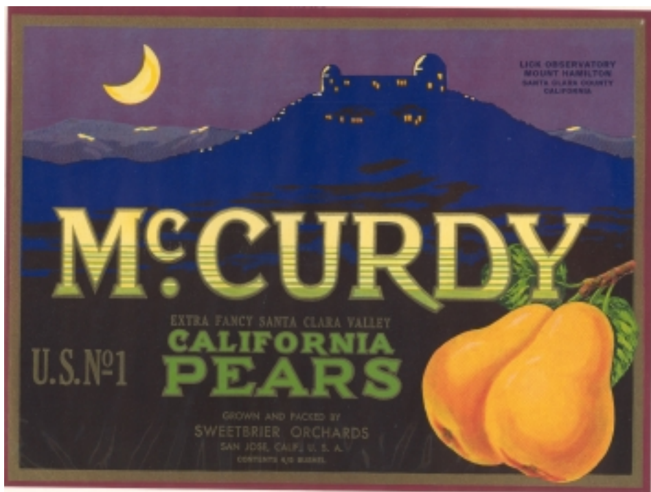
Above: a San Jose pear crate label depicting the Lick Observatory on Mt. Hamilton.