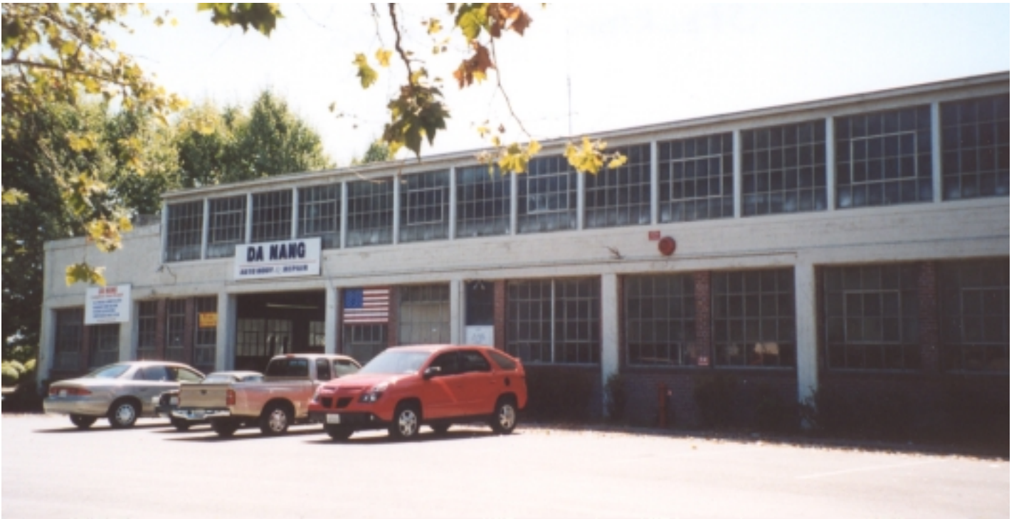
Above: The historic Muirson Label Plant on Stockton St. The city's Planning Commission has recommended that it be demolished to make way for a housing complex despite opposition from preservationists and neighboring residents.