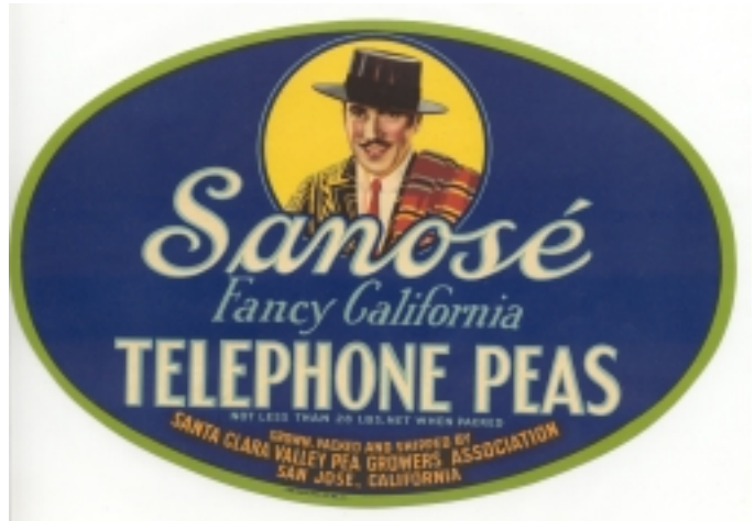
The endangered Muirson Label Plant on Stockton St. made fruit and vegetable crate labels like the one shown above.