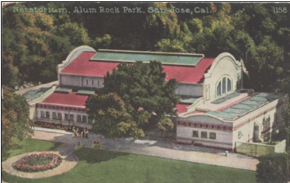
The Alum Rock Park Natatorium.